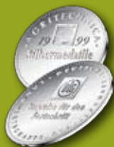
Silver Medal Innovation Award 1999 of the DLG (German Agricultural Society)

Innovation prizes such as the Eberle-Prize of the Federal State of Baden-Württemberg (1993) and the Silver Medal of the German Agricultural Society (DLG – 1999) give evidence on how successfully the high-tech potential of the TRIME ® -TDR-technology has distinguished itself in practice. Numerous industrial and scientific projects confirm the advantages of the TRIME ® -technology which by now has excellently performed under difficult conditions for 10 years at temperatures of up to 150°C and in application scenarios where other measuring systems failed to perform. You can find further information regarding the benefits of the TRIME ® -TDR, in comparison to moisture measurements conducted on the basis of conventional capacitive methods or microwave technology, on our homepage www.imko.de under the topic „About TRIME-TDR“.