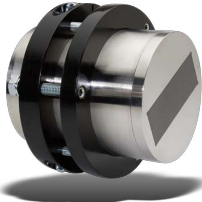
SONO-MIX moisture probe installed into a mixing pan bottom.

Highest accuracy at the measurement of moisture and material composition in fresh concrete – directly in the mixer using state-of-the-art RbC technology.